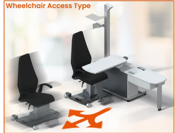
Wheelchair Access Type