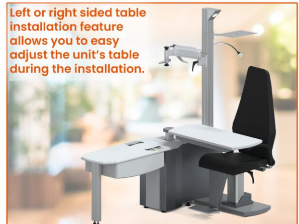
Left or right sided table installation feature allows you to easy adjust the unit's table during the installation.

IMPORTANT Yuratek Ltd. Şti. subject to change in design and / or specifications without advanced notice. For detailed info please contact your dealer.