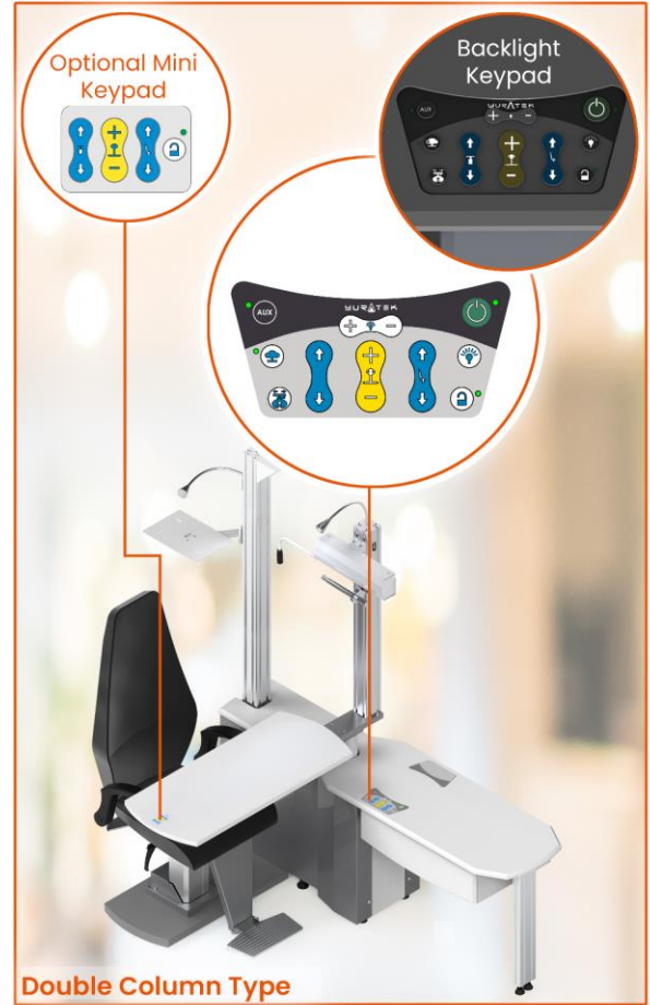
Double Column Type